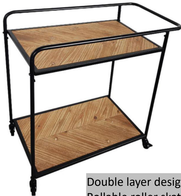
Double layer design Rollable roller skates