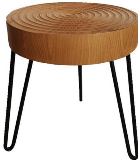
Table top year round design Vintage with texture Iron table legs