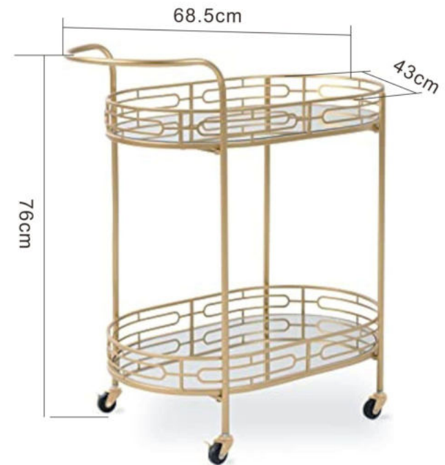
Oval shape with mental Movable wheels