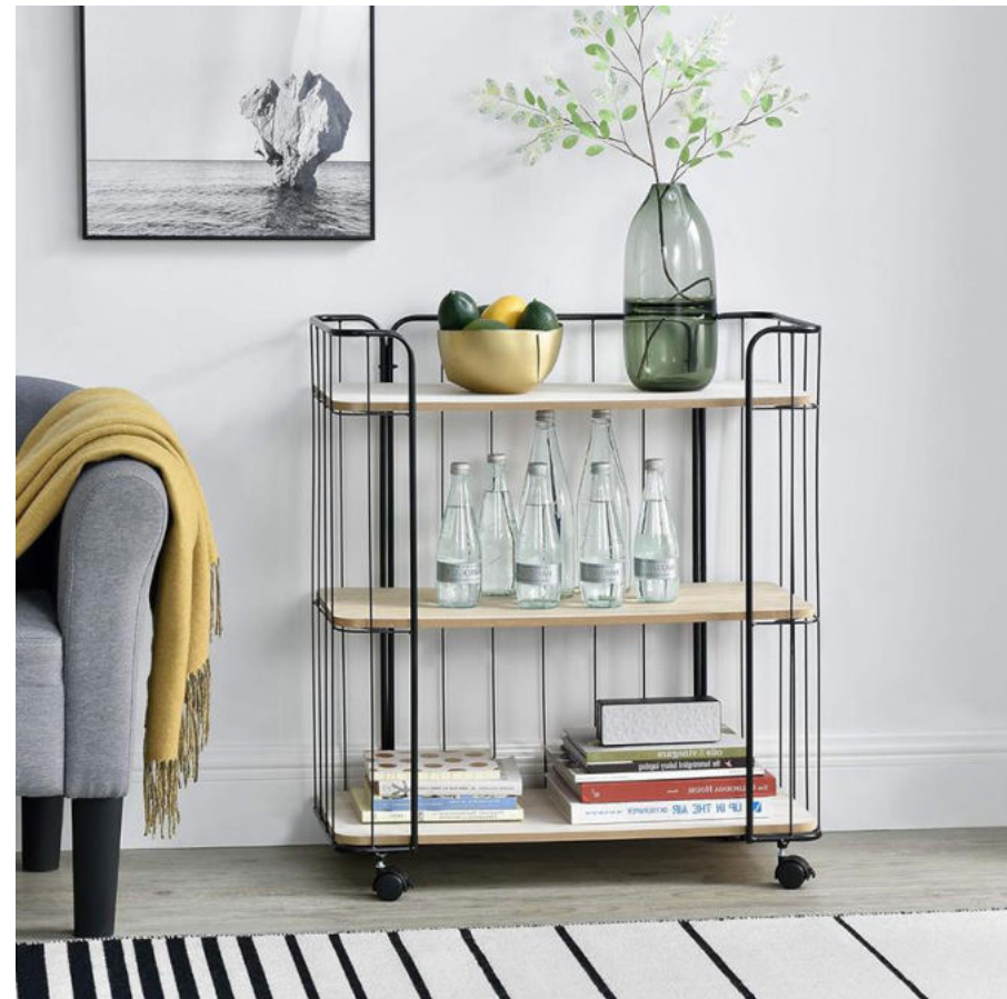
Combination of metals and three wooden layers movable wheels