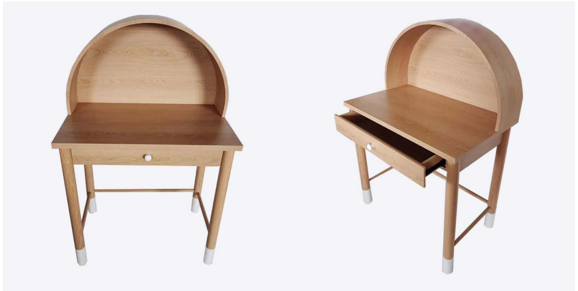
Semicircular arc design Drawer design