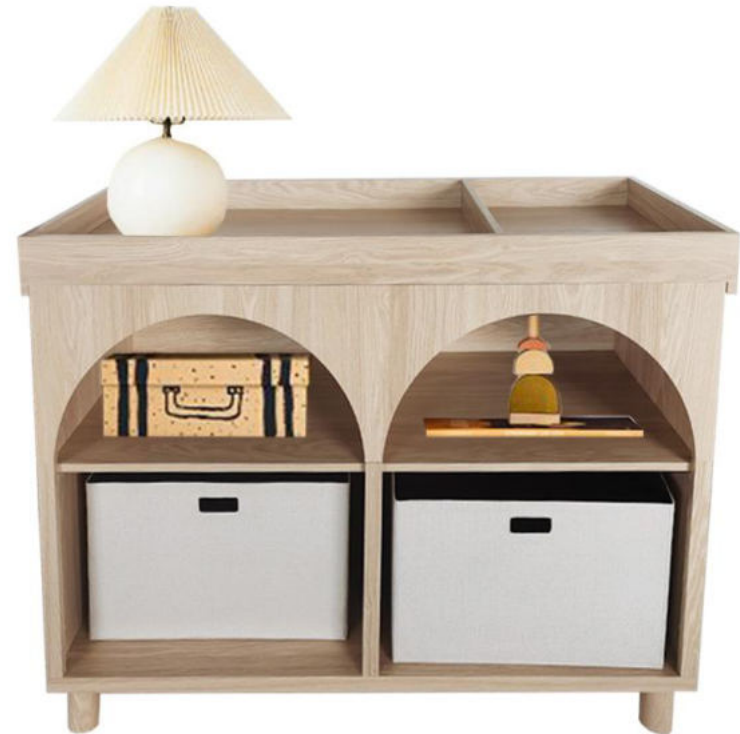
Arch-shaped design Partitioned Storage