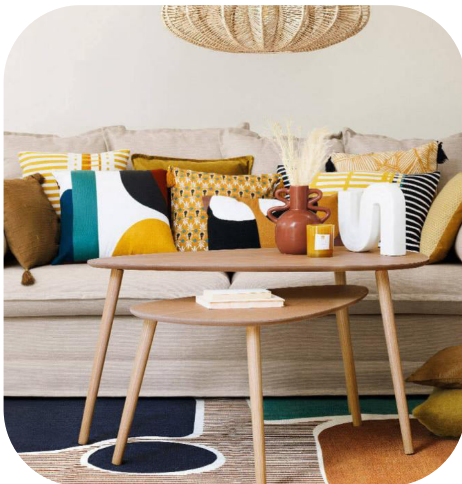
Rounded Corner Design Cross design